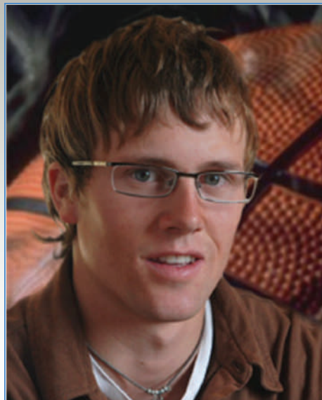
STYLE: NBA 822-52 GUN