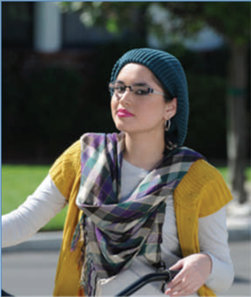
STYLE: AS0603-50 BLU

We recommend the Amadeus AS0603 for the ladies and the A908 and NBA 822 for men, as shown below.