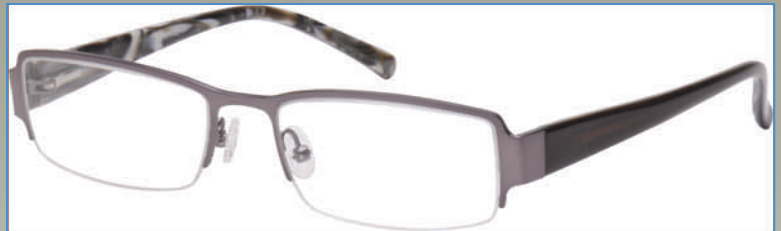
STYLE: A908-53 GRY