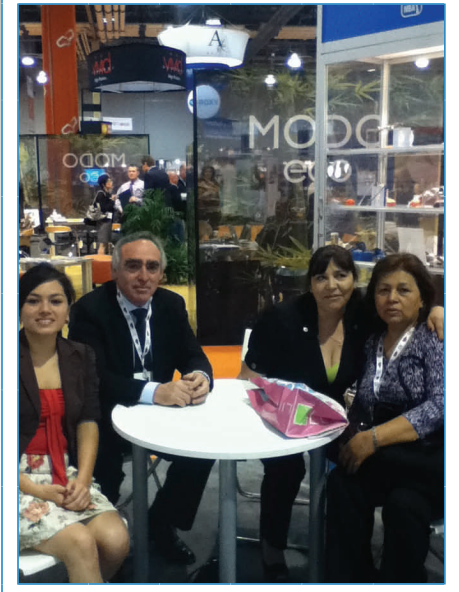
Left: Our customers from Chile and Peru.