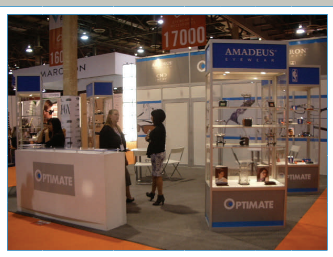
Our booth at the Vision Expo West