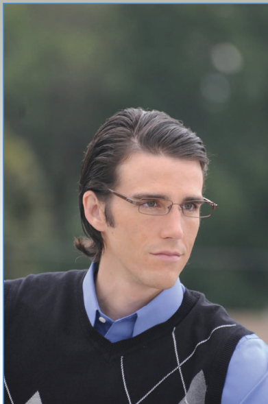
STYLE: 5255-50 MBR

Classic styles with thin metal rims are coming back this winter with an updated style that walks the super-chic line for both men and women. If you're looking for the balance between stylish and simplicity, we recommend the Baron 5255 as shown on the left.